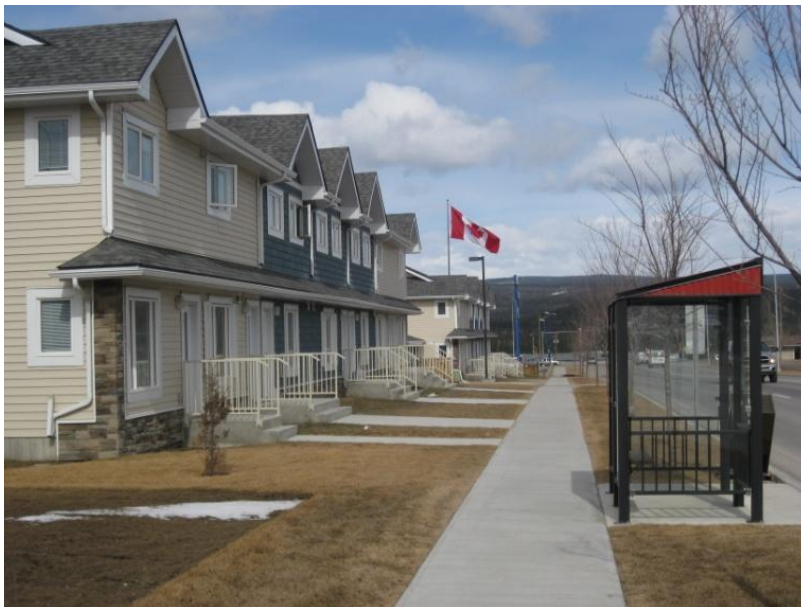
Colourful Places to Live and Play