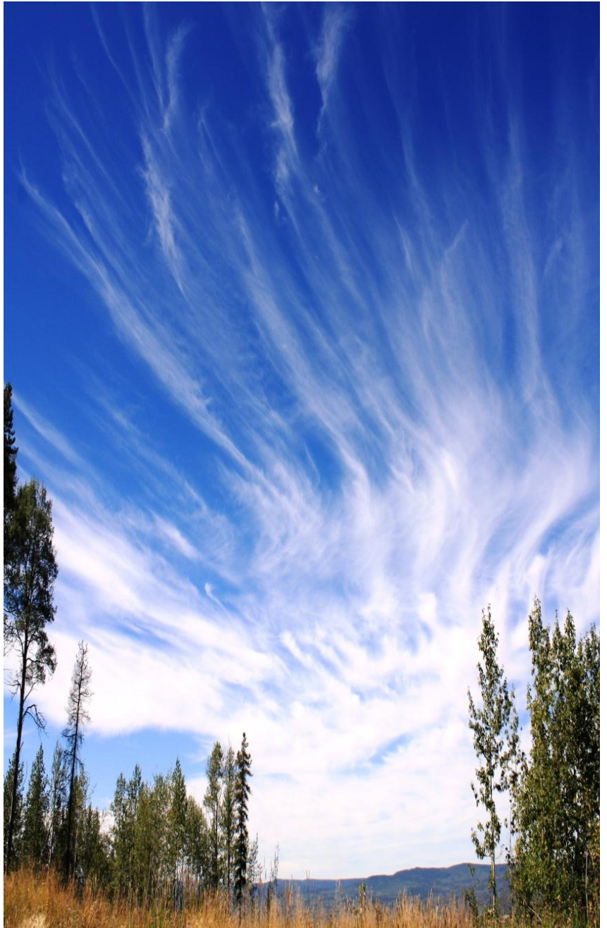
Big Sky Thinking